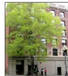
Reynolds Reentry Center Seattle, WA