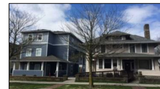
Bellingham Reentry Center Bellingham, WA