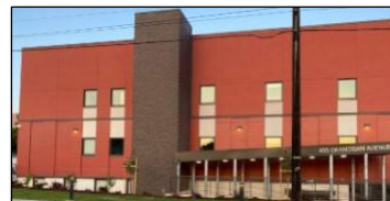
Wenatchee Valley Reentry Center – Wenatchee, WA

Are there restrictions for individuals on certain medications or medical needs: There are no restrictions on types of medications people can continue while at a Reentry Center. People in Reentry Centers leverage community-based health services and there may be limits based on what is available in the community. We work with people with disabilities and there are some facilities which may be more equipped to address individual needs.