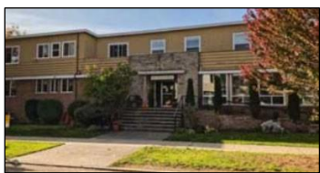
Helen B. Ratcliff House Reentry Center - Seattle, WA

Reentry Centers are designed to assist Residents in addressing their primary needs before rejoining the community and becoming good neighbors.