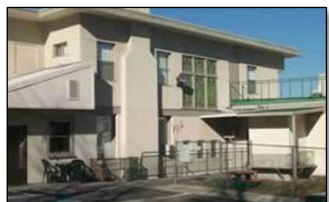
Eleanor Chase House Reentry Center - Spokane, WA