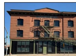
Brownstone Reentry Center Spokane, WA