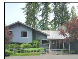
Olympia Reentry Center Olympia, WA