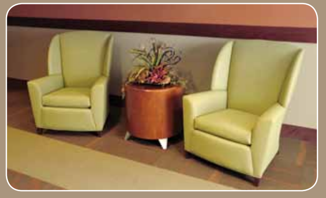
Washington State Correctional Industries reupholstered several pieces of the Eagles Landing Hotel's existing furniture to demonstrate their capacity and quality of workmanship.