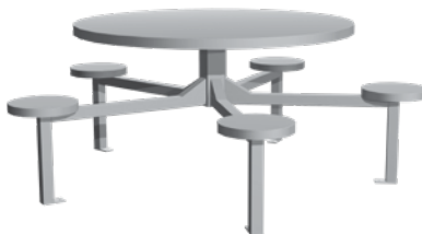
F. Five person outdoor spider base table.