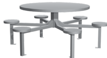
G. Six person outdoor spider base table.