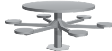
D. Six person metal outdoor pedestal table.