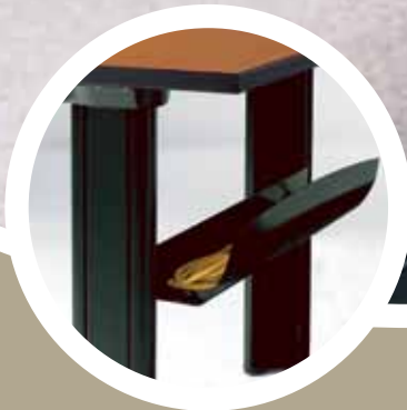
Optional wireway trough provides storage for all your wire management needs.