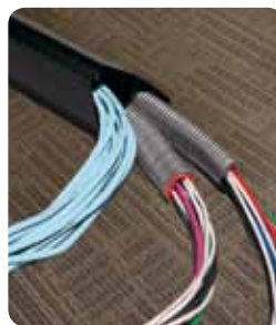
Power poles allow ceiling feeding of both power and data cables, separated by an aluminum divider.