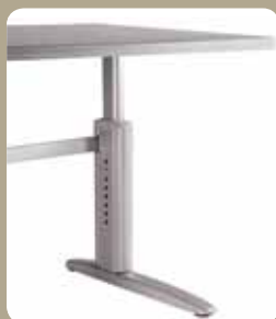
Pin adjustable legs are spring-loaded to easily raise or lower your table height from 24"-31".