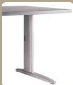
Fixed legs are 29" in height and offer an attractive alternative to their adjustable counterparts.

Genesis adjustable worksurfaces can also help you reduce the life-cycle cost of your office furniture. Now the individual user can adjust his or her own desk, which is built to handle any standard sized computer monitor without rocking or shifting. Genesis free standing adjustable desking from Correctional Industries is the perfect combination of flexibility, affordability and performance. Perhaps most importantly, the attractive Genesis worksurfaces fit any office environment – making employees more comfortable and more productive.