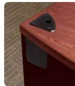
Desktop grommet covers easily open and close to allow access into the desk legs and wireways.