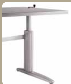
Crank adjustable legs raise or lower the surface from 22"-33" or 27"-43".