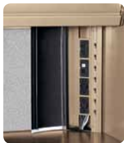
Power and data modules are easily relocated and configured for multiple user needs.