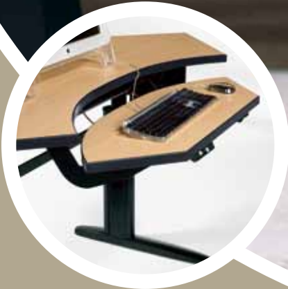
Dual worksurfaces adjust from 5" above to 5" below worksurface height and offer additional tilt control.