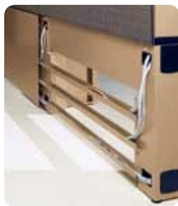
Optional cable troughs with full covers are available for situations that warrant it.