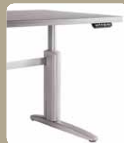
Electric adjustable legs raise or lower the surface from 24" to 51". Deluxe control allows for four separate preset heights.