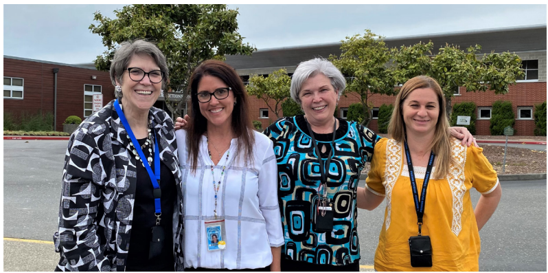
Publication Number 100-NE002