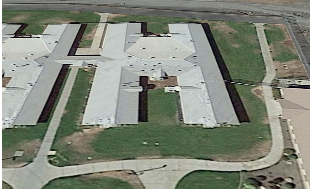
AHCC Unit C-4

The purpose of this project is to renovate the Airway Heights Corrections Center (AHCC) Unit C-4 to create a skilled-nursing unit to accommodate the special needs, aging and infirm male population that is currently being housed at Coyote Ridge Corrects Center (CRCC) Sage Unit. This is an important part of the Department of Corrections (DOC) Unit Closure plan that ensures essential services are provided for vulnerable individuals within the prison population.